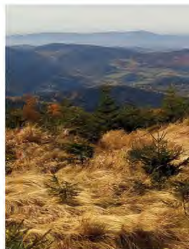
Photo: The Nature Trail Hojsova Stráž - view of Mústek