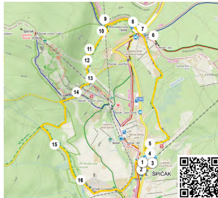
Route: The History of the Village of Špičák

The starting point is situated in the centre of Železná Ruda by the motomuseum in the former building of the stately home Zámeček. The route goes on together with the Glass Nature Trail along Sklářská Street to the bridge over the Řezná, then to the left behind the railway towards the cemetery, behind which a beautiful tree avenue follows (Boards D1-D3) to the place where the stately home Debrník used to stand (D4). From here the trail carries on ca. 400 m into Ferdinand's Valley (D5 – D7), and then back to Debrník. Then the route leads farther down towards Alžbětín (D8-D9) under the viaduct and over the Řezná. Then it turns left onto the cycle track (D10 and D11) and it continues along to the former customs house in Alžbětín D12.