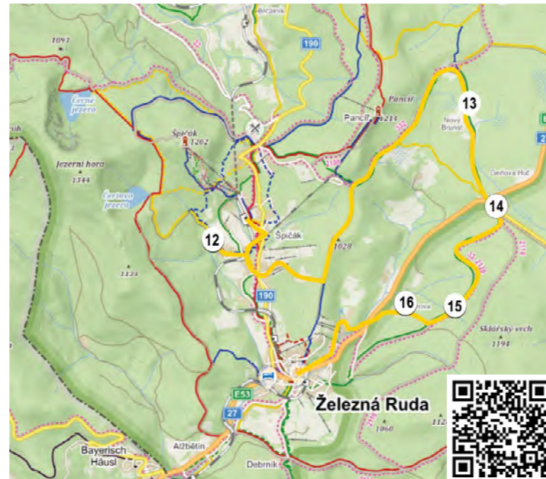
Route: The Glass Nature Trail, Part 2