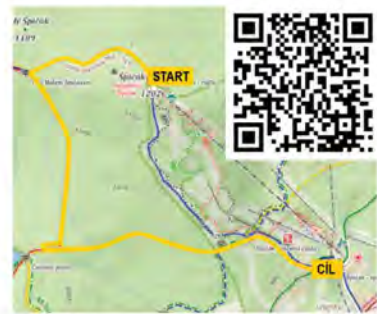
Route: The hare trail

SIGNAGE: its own one with boards LENGTH: 3.5 km VERTICAL DISTANCE: - 329 m NUMBER OF STOPS: 10 PARKING: in the village of Špičák in P1 (P for free) ACCESSIBILITY: by train (the station Špičák) and by bus (the bus stop Železná Ruda, Stella) to the village of Špičák, after that about 500 m on foot into the area Ski & Bike Špičák.