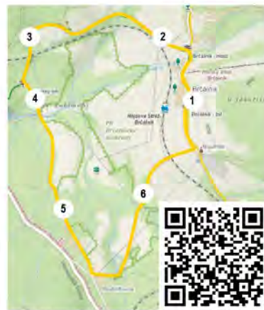
Route: The Nature Trail Brčálník

THE DESCRIPTION OF THE ROUTE: The starting point is situated near the railway station Brčálník, where there is an information panel with map and every single stop. It is based on a one-way move. From the initial panel the route proceeds through a built-up part of Brčálník to the turn-off left, where there is a panel with a panoramic description of view of the part of the Royal Deep Forest with Lake Mountain. Afterwards the route goes on along a field path past cottages,