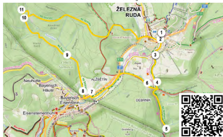
Route: The Glass NT – Part 1

The history of the local glass factories is only one of the chapters of a long story of famous glass-making of the Šumava Mountains and it is interconnected to the glass development in Bavaria nearby. Their business and family relations had been lively across the border for many centuries, concerning operators of glass factories, glassmakers, glass traders, builders of glass furnaces or providers of material. The names of many significant families of glass formen, glass-making factory owners – the Gerls, the Adlers, the Hafenbraedts, the Abeles, the Ascherls, the Ziegler, the Blochs or the Schrenks had been inseperable from the glass factories in the Železnorudsko area. Thanks