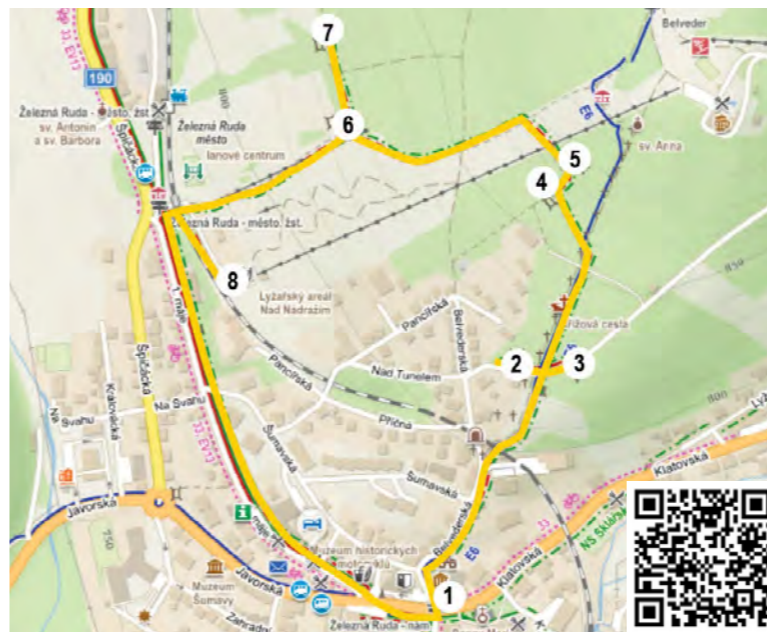
Route: The Belveder Route

LENGTH: 2.5 km VERTICAL DISTANCE: +/- 94 m NUMBER OF STOPS: 8