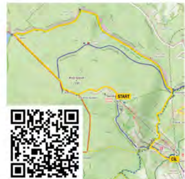
Route: The three-toed woodpecker

The three-toed woodpecker is one of the inhabitants of the forests of Špičák. It will guide us through the forest to Black Lake. Thanks to its living in treetops it knows a lot about the local nature. Let's go through the Three-toed Woodpecker Trail and answer 10 questions, solve a solution and learn something new about the Šumava Mountains.