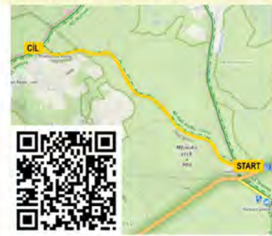
Route: The Snake Trail

The route begins at the shelter in Gerlova Hut with its yellow signage and it goes along it two kilometres to the north-west. Using this trail, it is either possible to go back to the parking lot in Gerlova Hut, or to keep on walking 5 km far, at first following the green signage and then the blue tourist signs to Železná Ruda.