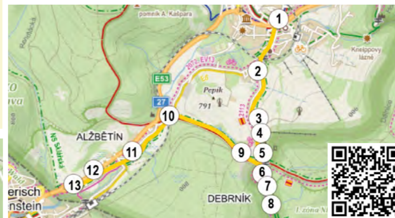
The Route: Debrník