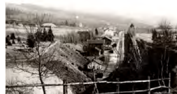
Photo: The History of the Village of Špičák – the Špičák railway station