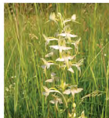
Photo: The Nature Trail Brčálník - Platanthera Chlorantha